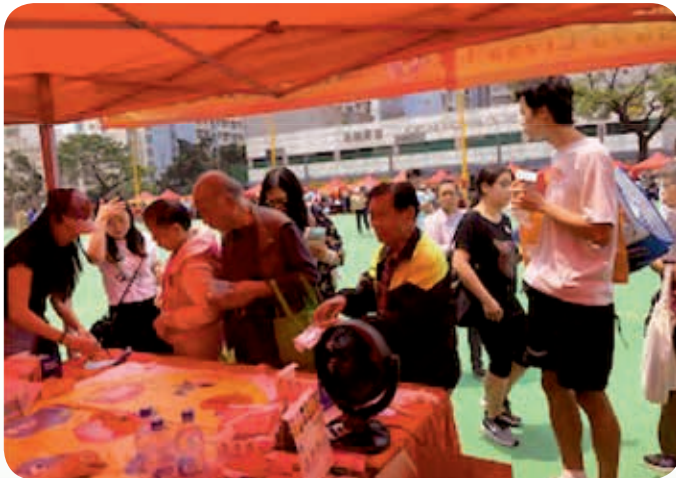
Game booth for Prevention of Influenza