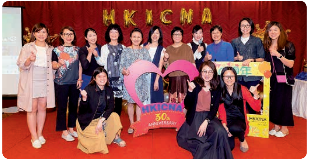
Work group of 30th AGM

The party is over but we all have much memory to cherish and lots of cheerful moments to look at ... Celebrations would have been incomplete without you. We are looking forward to seeing you in the next year.