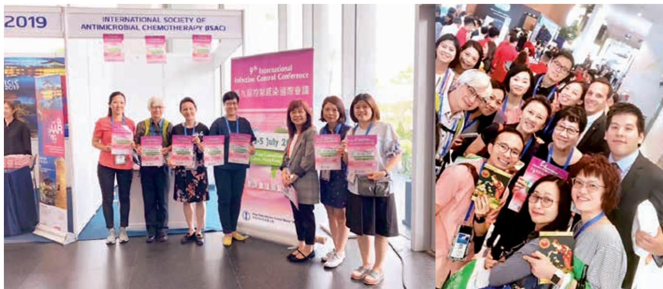
“Hey guys, we are promoting the 9th International Infection Control Conference at Hong Kong”