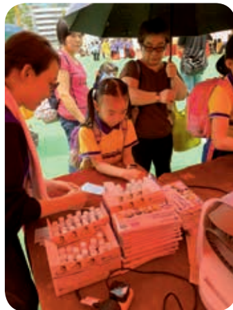
Young and old people enjoyed the hand hygiene checking by "CouCou box"