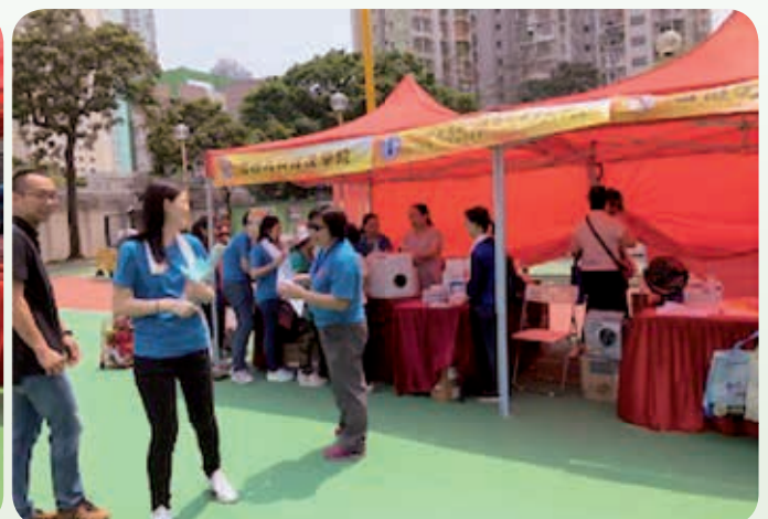
Volunteers from Nursing Schools