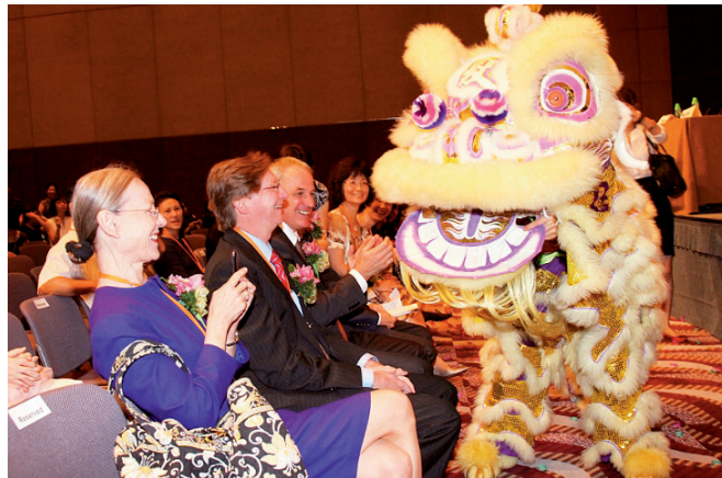
2010 - 4^{th} IICC opening