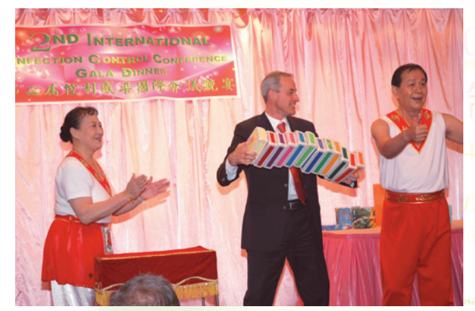
2006 – Gala dinner