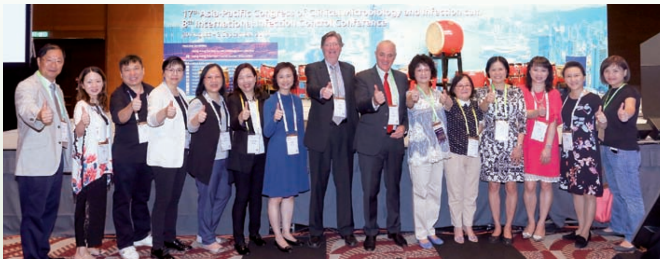
Thumbs Up for the "successful conference" by speakers, collaborating, OC, council members, and invited guests.