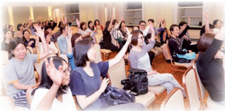
Members were so happy during the reporting