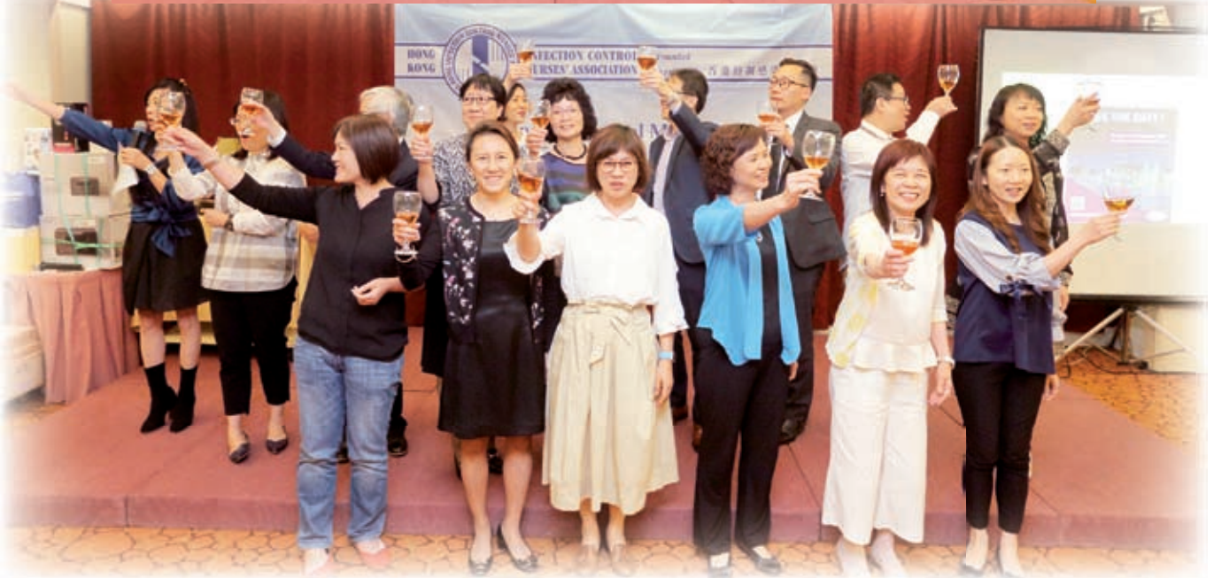
Advisors and Council: wishing you good health and good luck: cheers & cheers!