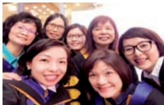
Happy day! Let's selfie!!