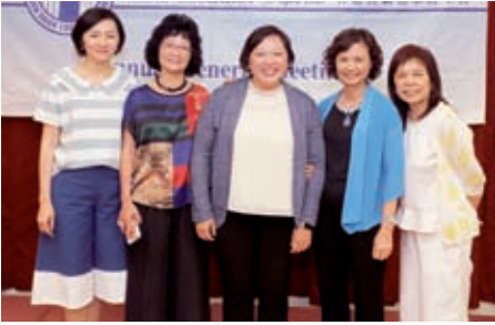
Thanks to Johnson and Johnson (HK) Ltd. for the sponsorship of the seminar

Our AGM dinner was a huge success, with lots of smiles and laughter shared. You can go to below to view our photos from the event: