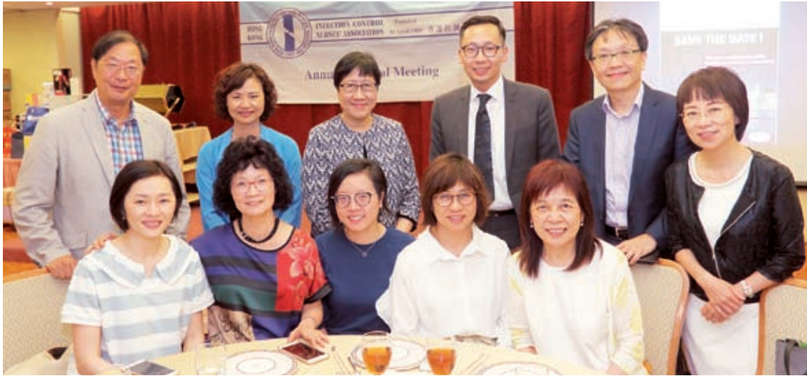
Advisors, council & guests.