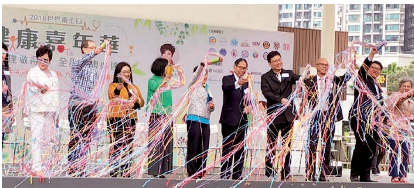
Opening ceremony by officiating guests

This year, we had two games - Infection control measures against Influenza and “How to do Hand hygiene- by applying the UV light and fluorescent agent”. Nursing students and tutor from CMC nursing school were invited to assist the survey of hand hygiene empowerment to both HCWs and Public.