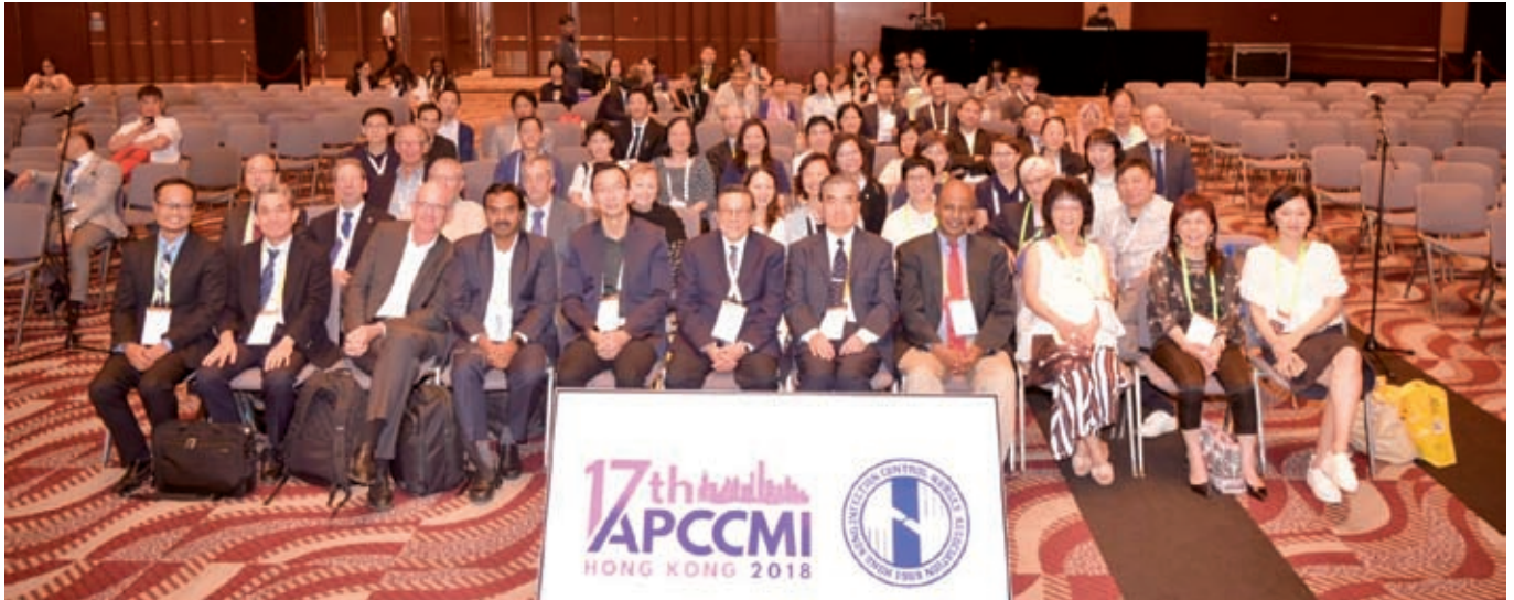
The conference concluded with a group picture of speakers, collaborating friends, guests, delegates, organizers and friends.