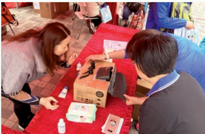
Game: "How to do Hand hygiene" – assessment by UV fluorescent agent