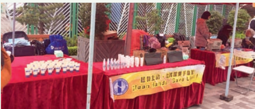
Special thanks go to Johnson & Johnson (HK) Ltd. and MEDICOM for sponsoring hand moisturizer and alcohol hand rub respectively to support the hand hygiene promotion in the community.