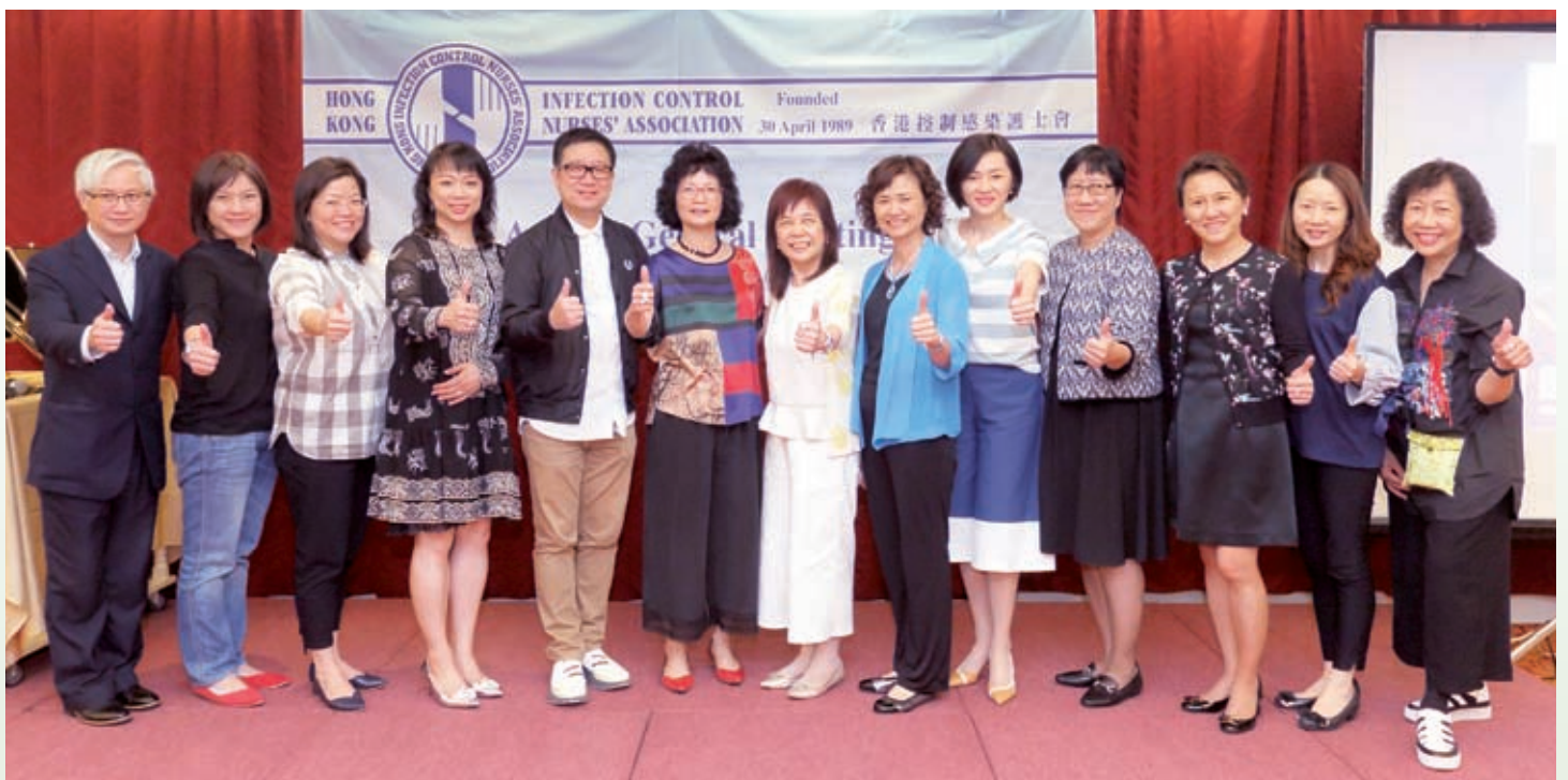
Thumbs up! The celebration gathering ended with lots of laughter and good wishes. See you next time for the 30th celebration.