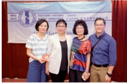
HKICNA & Collaborating society: HKENA