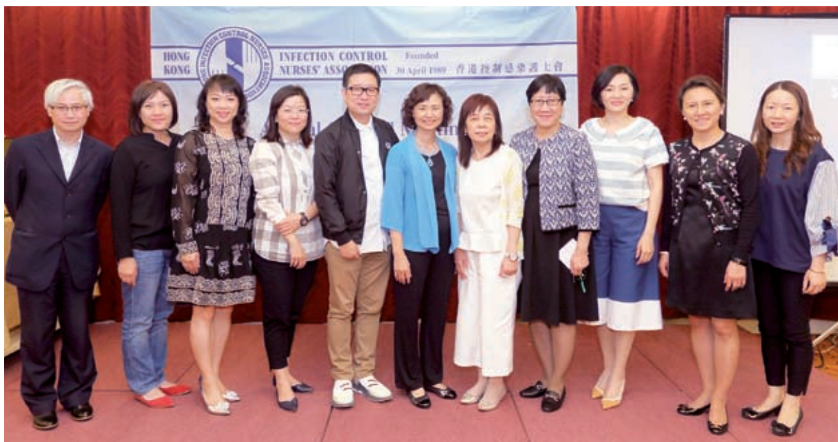
2017-2018 council members and founding chair