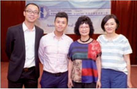
Thanks to Medicom for their support of our course in hand hygiene aspect.