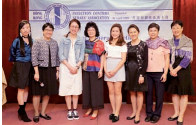
2018 AGM workgroup members