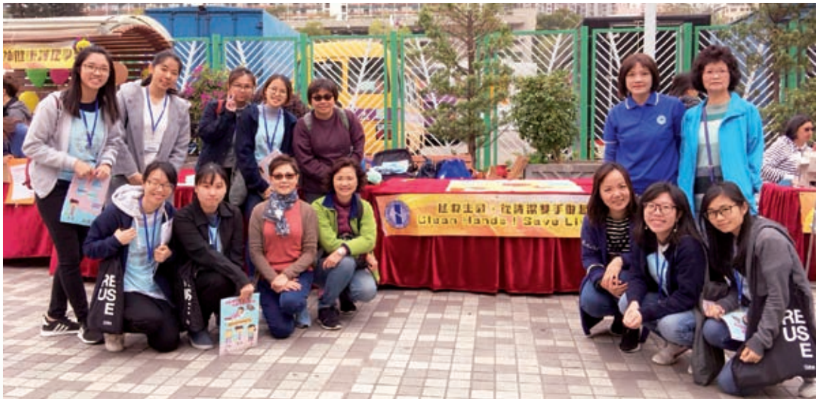
Nursing students and their tutor from CMC nursing school and Members from HKICNA