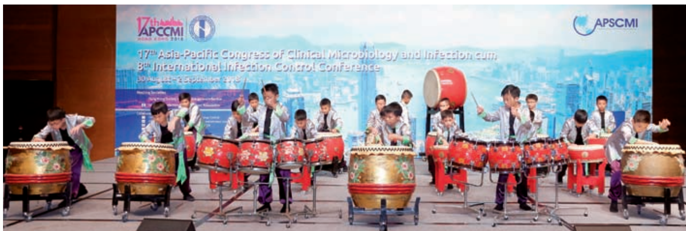
Look! Look! The drum team: The Thunder-Makers 鼓樂英騰 of Ying Wa Primary School. The boys played drums on *樂曲：鼓·律動* at the opening ceremony of the conference.