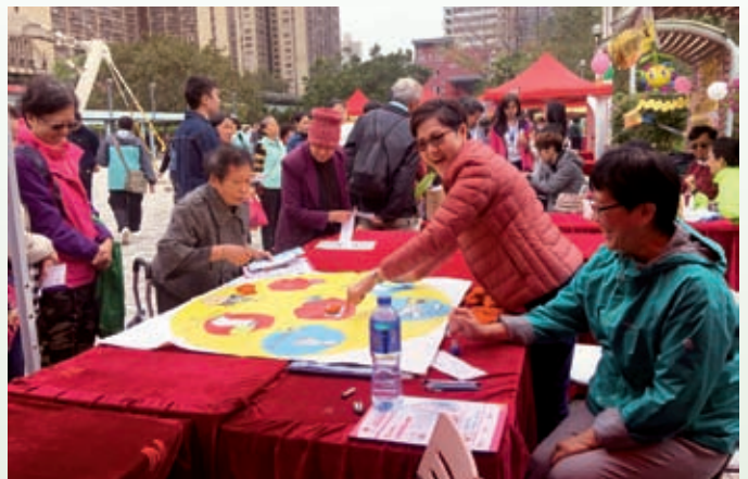
Game: Infection control measures against Influenza